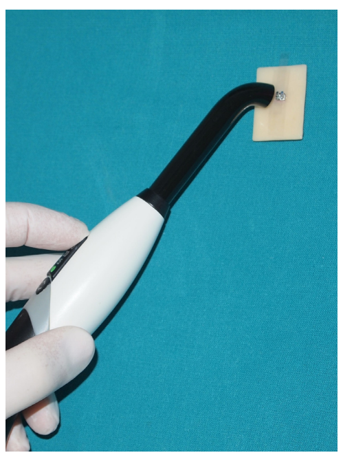
Figure 1. The adhesive was placed between two cellulose strips under a metal bracket and illuminated from the mesial and distal sides.

A cellulose strip was placed on a metalceramic pad imitating the surface of the tooth and a thin layer of primer applied followed by adhesive. This was then covered with another cellulose strip and firmly pressed with a metal premolar bracket. The Bluephase curing unit (Ivoclar Vivadent, Liechtenstein) was used for illuminating the specimens at 1100 mW/cm^2 , (10 or 20 sec) (Figure 1). The illumination times chosen were available in the curing unit settings and were in with the manufacturers' accordance recommendations which vary from 6 to 20 sec. In assessing the DC, Fourier transform infrared spectroscopy in conjunction with attenuated total reflectance was used on the EQUINOX 55 interferometer (Bruker Corporation. USA).<sup>15</sup> Each adhesive system sample was immersed in 1 mL of artificial saliva<sup>16</sup> in 1.5 mL tubes. Immersion lasted for 28 days in a thermal